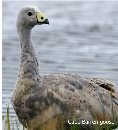
Cape Barren goose

Prior to European settlement, Aldinga Washpool was an important place for curing and drying possum skins. It is a significant place for ceremony, including exchanges with people from beyond Kaurna lands. It is especially important for Tjirbruke Dreaming, being one of the places that the ancestor Tjirbruke stopped and wept in grief on his journey from Tandanya / Adelaide Plains towards Parewarangk / Cape Jervis.